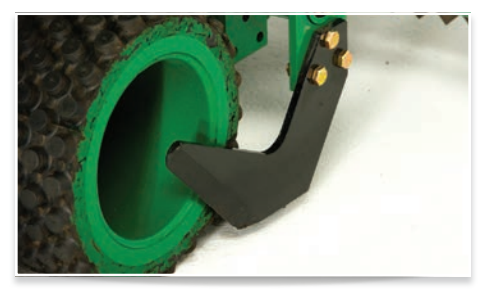
Durable cutting blade is easily adjustable down to a depth of 2 \frac{1}{2} " and can change angles to match soil and blade conditions.

Specifications subject to change without notice.