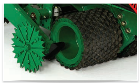
A forward metering wheel helps measure and cut sod accurately.